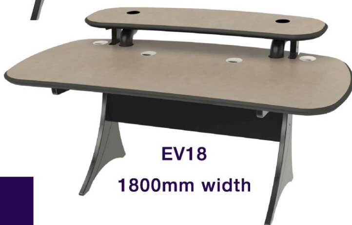
EV18 1800mm width