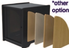
*other side insert options available