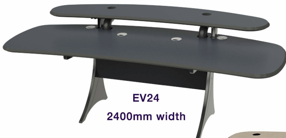
EV24 2400mm width